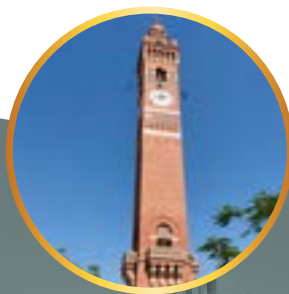
Husainabad Clock Tower